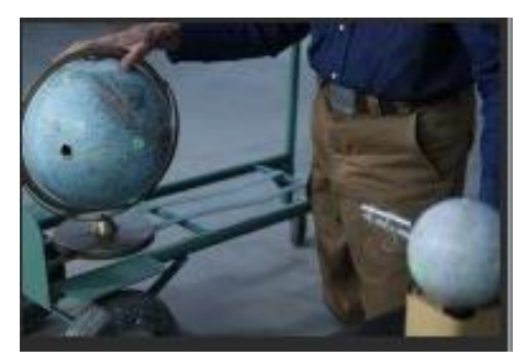
Two Known Truths that everyone must accept: